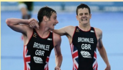
The Brownlee Brothers